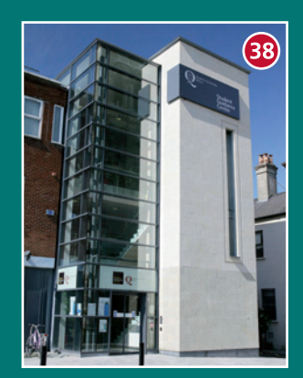
The Student Guidance Centre