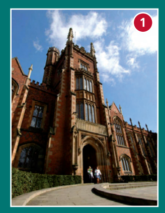
The Lanyon Building